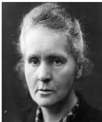
Marie Curie--Nobel Laureate twice!

$15 ($8 for students and the unemployed)