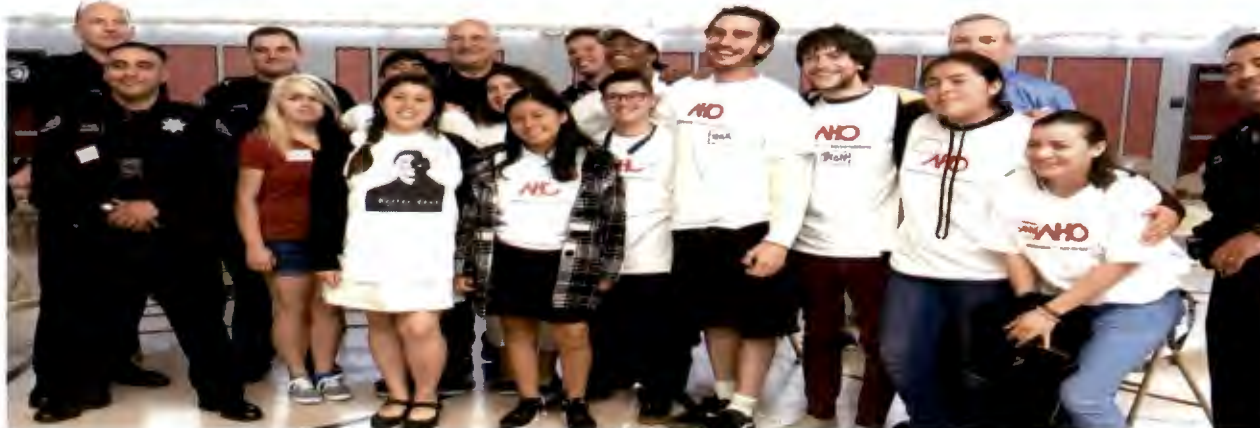
AHO Youth Team Leaders