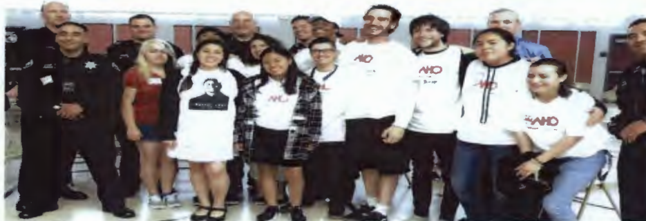
AHO Youth Team Leaders